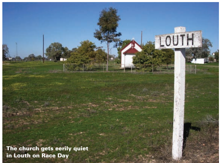
The church gets eerily quiet in Louth on Race Day

Wherever you choose to stay, you'll find the owners will go out of their way to make life easier for visiting pilots. Just be sure to plan well ahead and make any accommodation