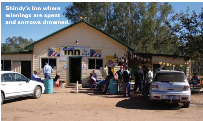
Shindy's Inn where winnings are spent and sorrows drowned.