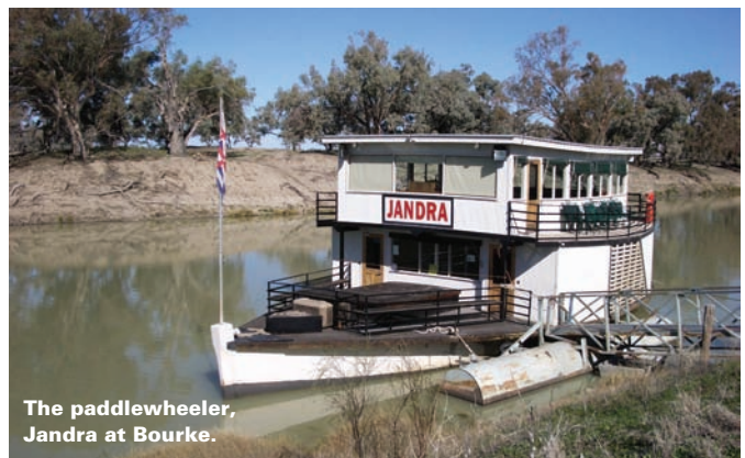
The paddlewheeler, Jandra at Bourke.